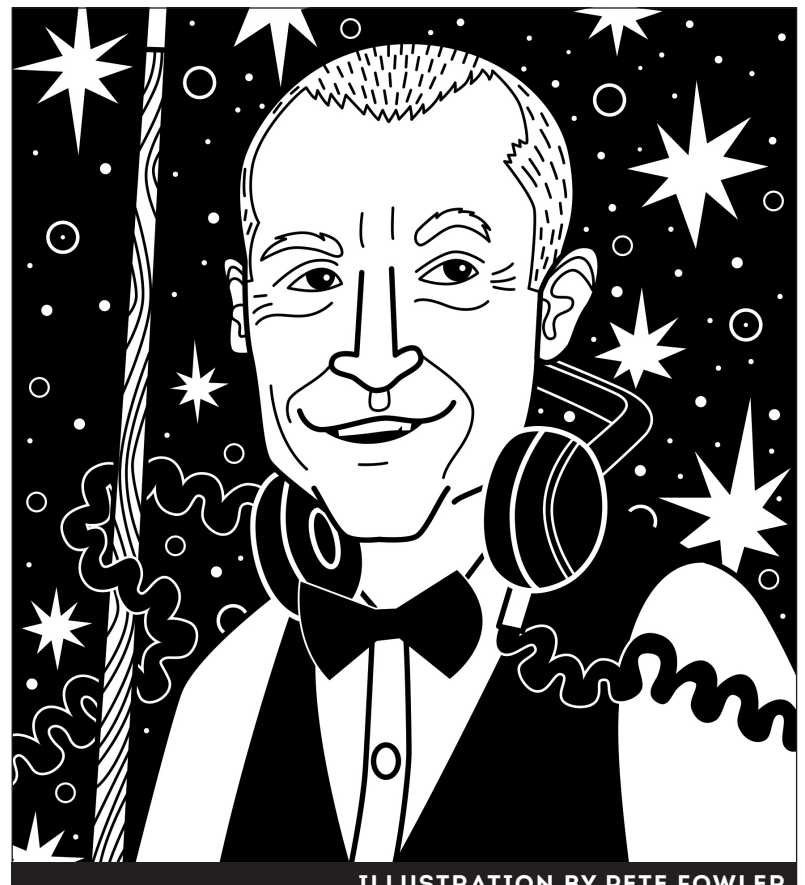
ILLUSTRATION BY PETE FOWLER

Oh god, yes. People often say that I reached my peak during the best years of the game, but snooker is bigger now than it's ever been. Around 27 per cent of the Chinese population - that's nearly 300 million people are said to have watched Ding Junhui playing in the 2016 World Championship final. And I think it's only a matter of time before snooker becomes an Olympic sport. It's got every right to be there up with other control sports like archery and shooting, let alone dressage or synchronised swimming. Whatever criteria you choose, you could argue for its inclusion. Same with darts.